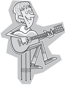
g u i t a r

1 Escribe los instrumentos. Completa las palabras con a, e, i, o, u.